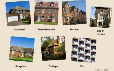
The seven main types of houses in the UK: