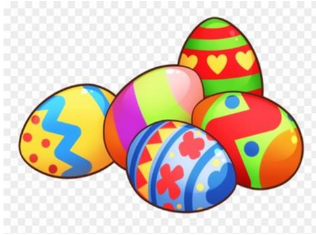
3 - Decorating Ideas

Shadsworth Infant School Council are holding an Easter Egg Raffle - £1 per strip - The School Council will visit classes from Monday 18th March 2024 prizes up for grabs! There are three Eggcellent The draw will take place on Wednesday 27th March 2024.