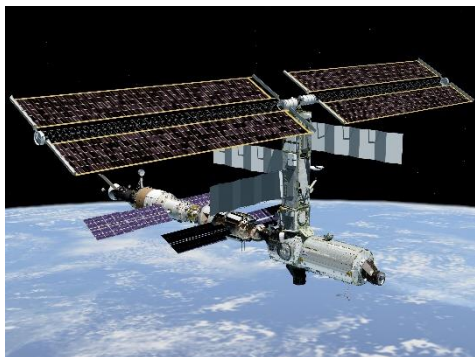
International Space Station